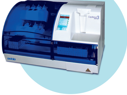
CAPILLARYS 3 OCTA / TERA